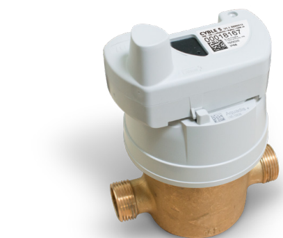
Aquadis+ equipped with the Cyble 5 module