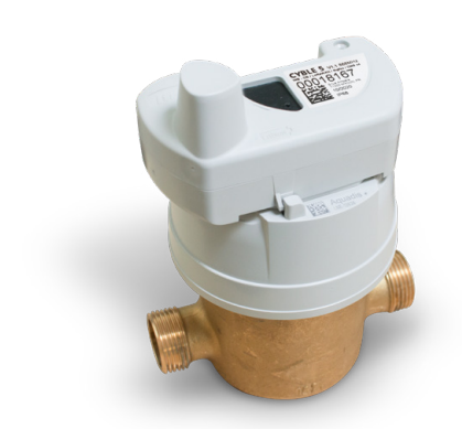
Aquadis+ equipped with the Cyble 5 module

with respect to the content of these marketing materials. © Copyright 2024 Itron. All rights reserved. SYS-0074.3-EN-India-07.24